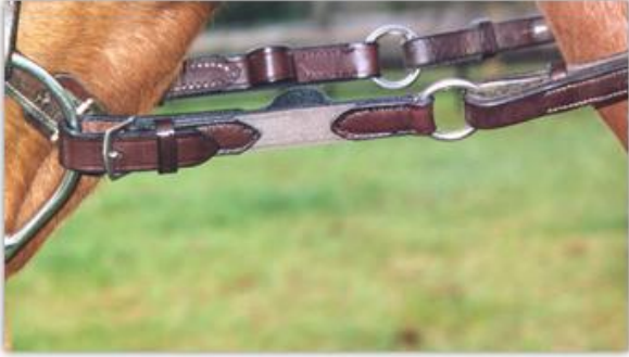
Kuva1: Rein-Aid, lyhyt välikappale normaaliohjan ja kuolainrenkaan väliin, 45 € sis alv 23%

Vähentää nykäisyjä kun ratsastaja jää jälkeen tai menettää tasapainoaan.